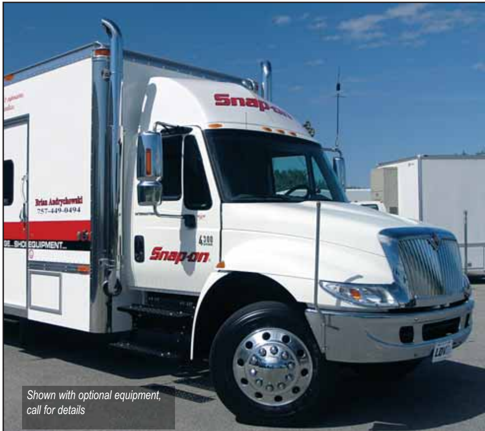
Shown with optional equipment, call for details