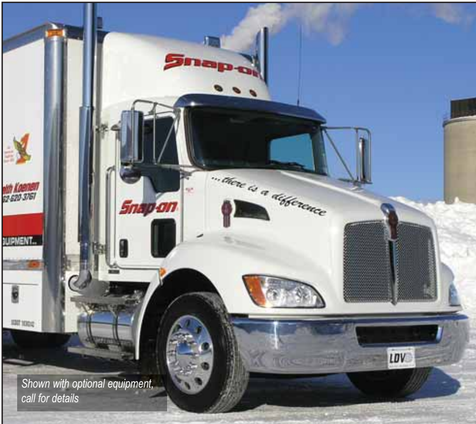
Shown with optional equipment, call for details