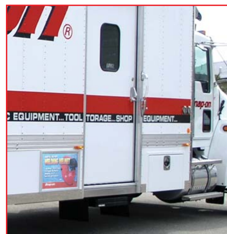
The signage on the XLerator New/Featured Product Display fits your Mobile Tool Store's exterior aluminum sign holder.

For more information on these products contact LDV at 1-800-558-5986.