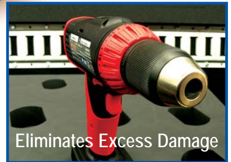
Eliminates Excess Damage