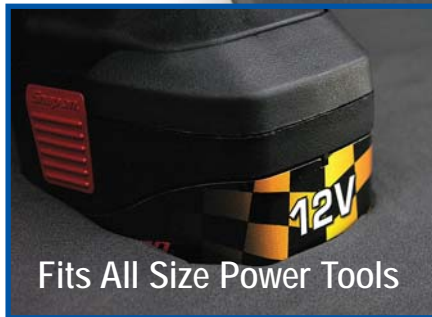
Fits All Size Power Tools