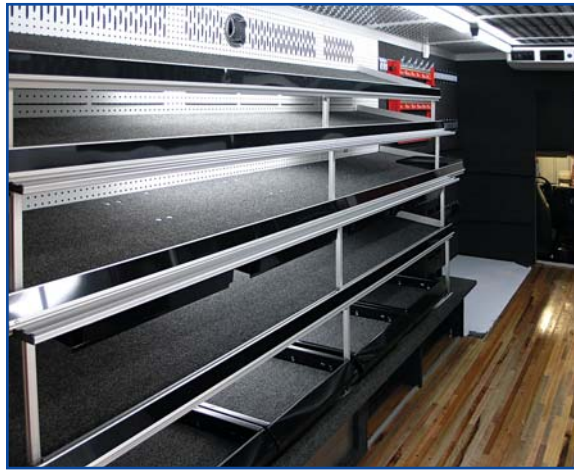
◀ The street side interior features a shelving module with five carpeted shelves with undershelf lighting and new extruded aluminum socket rail.