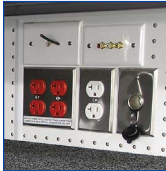
▲ Telephone jack, DVD Audio/Video inputs, computer/printer power (orange) and demo power outlets are located together for ease of use and hidden away behind the rainbow stack.