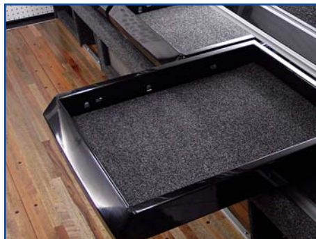
▲ Four XLERATOR Display Drawers (above) give you premium organization, storage and merchandising capability.