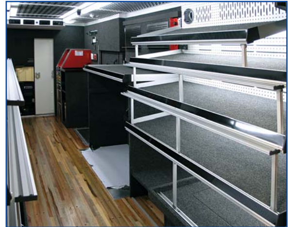
▲ Curb side interior features a 50-inch rolling tool box area, a Snap-on Rainbow workstation, five carpeted shelves with lighting and LCD video monitor (not shown).