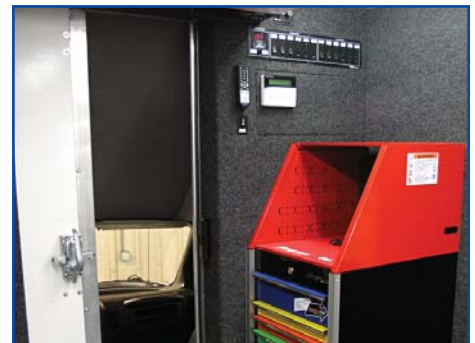
▲ For privacy and security the Franchise XL 5500 has a sliding pocket door separating the Mobile Tool Store interior from the drivers cab area. Alarm, lighting and power controls are clustered above the rainbow computer stack for easy operation.