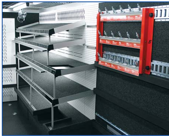
◀ The street side interior features five carpeted shelves, an air tool display, tool box area and vice station.