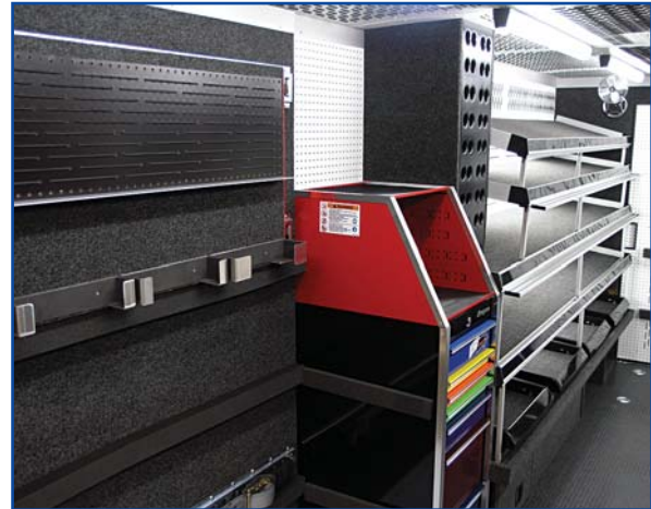
▲ Curb side interior features a 50-inch rolling tool box area with diagnostics display, a rainbow workstation, 32-slot hammer rack, five carpeted shelves with lighting and four shelf mounted drawers.