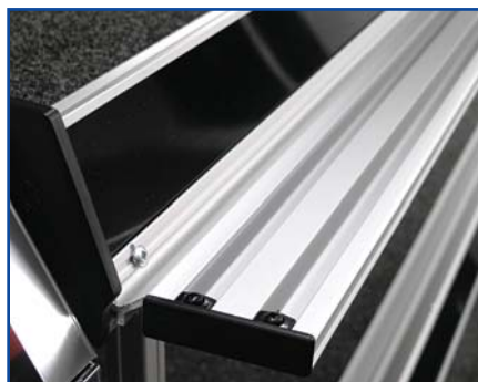
▲ The extruded aluminum shelf (shown above) is designed to offer you optional graphic signage capability, and dual extruded aluminum socket display.