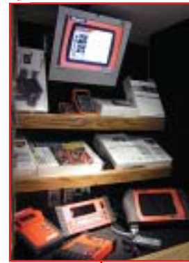
The Diagnostics Area has a video capability for showing the Snap-on Modis system