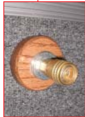
A built-in air supply with quick disconnect provides easy air tool demonstration