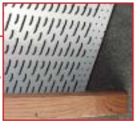
The cab has a utility shelf and 3/16-inch thick, black face board for added storage and display