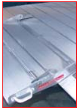
A 2,000 lb capacity, 72-inch Walco all aluminum cam closure liftgate with flip-out extension and cart stop