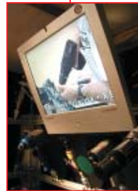
A 15-inch LCD monitor shows Snap-on product promotions or training videos