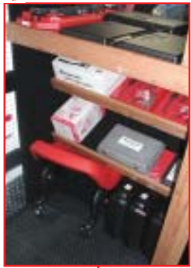
Easily organize your product lines in the MTS 3000 shelving display and storage areas