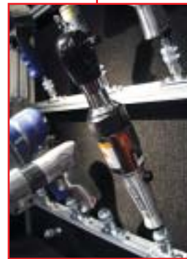
Air tools are displayed on a wall-mounted rack system with quick release connectors