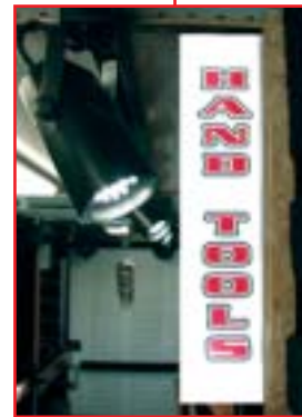
Adjustable overhead track lighting fixtures add emphasis to displays and signage