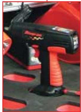
A variety of cordless power tools are stowed and displayed in durable foam cutouts