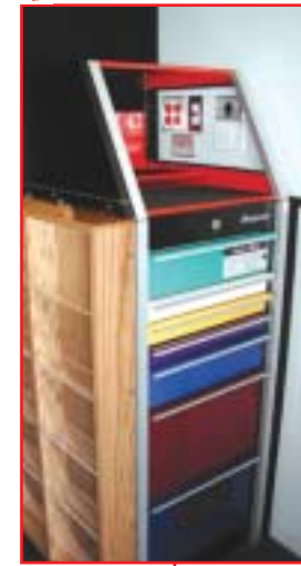
Your mobile office has plenty of room for laptop computer, printer, sliding brochure rack, metal storage drawers, portable broken tool drawer, and formica flip-down writing surface for customer orders and receipts