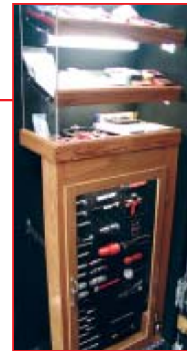
A combination display and storage module featuring a lighted knife case, creeper storage, and shelving offers premium merchandising of your best sellers or special promotions