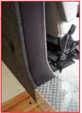
The cab/chassis has a convenient walk through with flexible accordion boot and fabric cover, 1/4-inch diamond plate for kick protection, and lockable service plug for added security