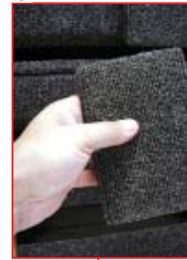
The 12-inch wide carpeted hammer rack has adjustable velcro shims for keeping tools secure