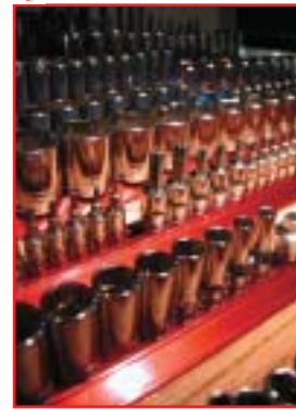
The socket display uses color coding (red) for standard and (blue) for metric sets