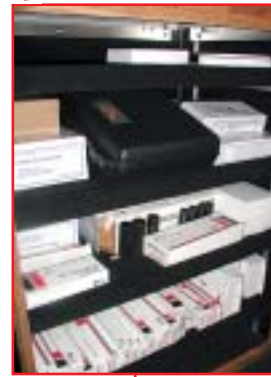
The MTS 3000 system provides plenty of hidden storage areas