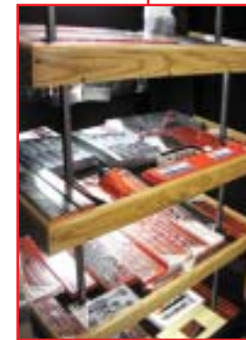
The large rolling storage area will handle a combination of modular lighted rolling shelves or the Snap-on tool boxes