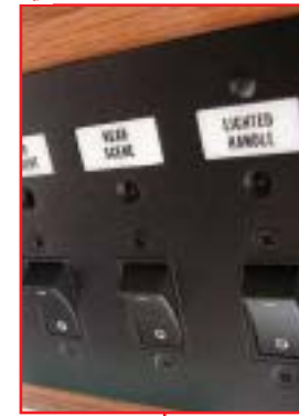
Operate the entire MTS 3000 electrical system from a convenient wall mounted control panel