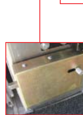
Electric dead bolt door lock mechanism operated by the driver for added security